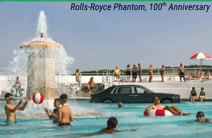
Rolls-Royce Phantom, 100 th Anniversary