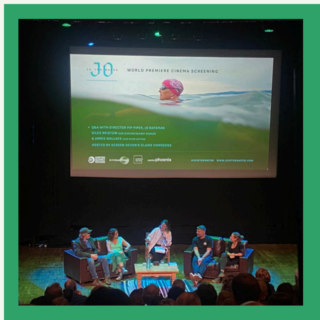
Jo in the Water Premiere

Time spent in deep, high-impact collaboration rather than surface-level engagement. Prioritising quality of support over volume, ensuring that each engagement moves filmmakers forward meaningfully.